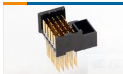
TE Part # 5120752-1 Z-PACK HS3 HDR ASY 10R 50P