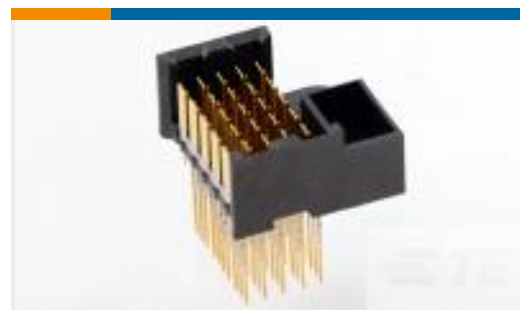
TE Part # 5120670-2 Z-PACK HS3 HDR ASY 10R 50P