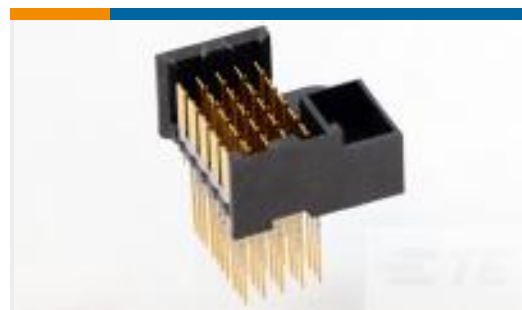
TE Part # 5120670-1 Z-PACK HS3 HDR ASY 10R 50P