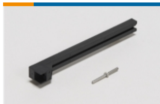
Header & Receptacle Guide Hardware (1)